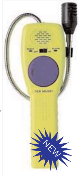
Price Start at $150.00

Each Unit includes, soft pouch carrying case, batteries, operators manual.